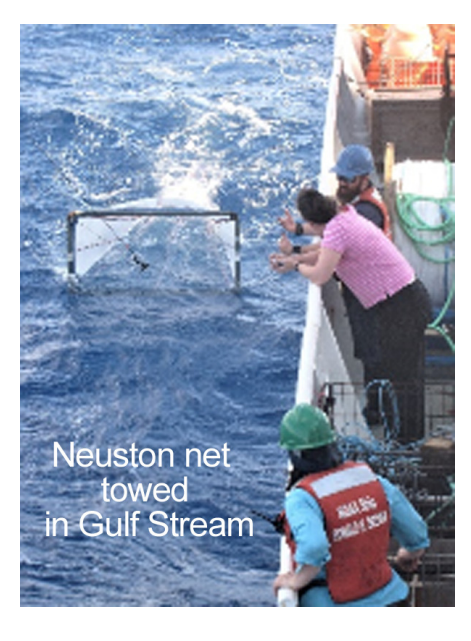
Volume 30, No. 1

some remarkably calm days. Examining and servicing the sensors is like reading a chapter on marine ecology. Canisters moored at the warm, sunlit surface were calm calm days. Examining and servicing the sensors is like reading a chapter on marine ecology. Canisters moored at the warm, sunlit surface were covered with biofouling organisms typical of shallow water - algae, hydroids, worms, mollusks, bryozoans and barnacles. As sensors from dark, deep and colder waters were hauled up, the variety of organisms diminished quickly; although surprisingly, the number of tooth marks from sharkb bites. With a plankton net, I collected a variety of Morrison's "tiny monsters" from these offshore waters; some of the zooplankton being quite colorful. Pteropods (pelagic sea snails) were particularly abundant in the samples. Besides being important food for whales and fish, the shells of these sea butterflies are an environmental yardstick for paleo-geologists, since they accumulate at relatively shallow ocean depths. R.S. Wimpenny (The Plankton of the Sea, 1966) calculated that extensive deposits of "pteropod ooze" from their sinking shells cover portions of the Atlantic seafloor equivalent to the area of the Gulf of Mexico.