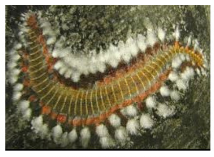
Fireworm from the bio-fouling community