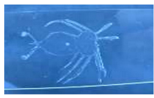
Inch-long Phylosoma larvae on a glass slide (one of the tropical lobsters from the Gulf Stream

Our offshore mission complete, it was time to depart placid Bahamian waters to initiate our sampling across what was described to me as the boaters' Wild West. This is the narrowest and perhaps most perilous stretch of the Gulf Stream — the Florida Current. I was forewarned that it is demanding work in the Straits, since for a day and a night we would be taking hourly water samples throughout the water