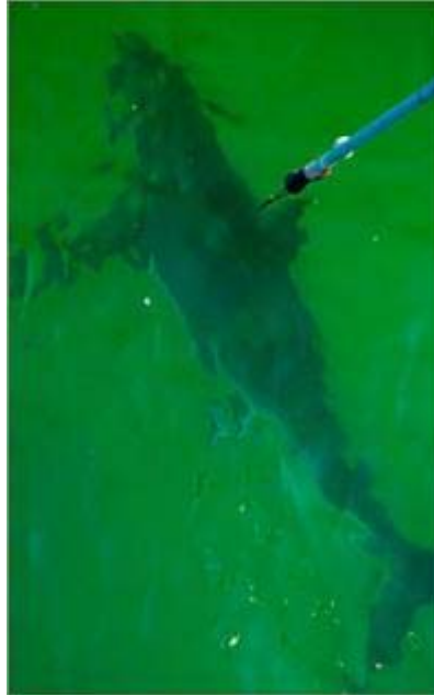
Scientists tagging a white shark in MA waters.

White sharks appear to be making a come-back along the Massachusetts coast. Five white sharks were recently tagged off Chatham, and satellite tags were placed on two of them. The tags are programmed to pop off on January 15, 2010, and will transmit data allowing researchers discern the sharks migratory patterns and behavior, as well as monitoring