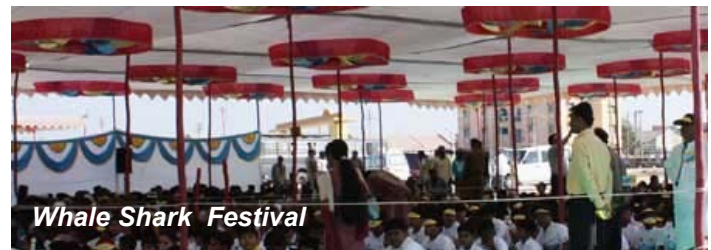
Whale Shark Festival

After the meetings the SAC traveled to the coastal city of Dwarka, to participate in this city's first annual whale shark festival. The festival involved a parade with a life sized inflatable whale shark, children in whale shark shirts, and a marching band. The parade was followed by a formal ceremony that included a children's art contest, a performance of a traveling street play about whale shark conservation, and speeches by officials supporting the whale shark campaign.