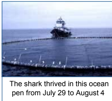
The shark thrived in this ocean pen from July 29 to August 4

Commercial halibut fishermen inadvertently snagged the young female fish in their nets off the coast of Huntington Beach and she was kept in a four million gallon pen until she was transported to Monterey Aquarium's 3,000 gallon tank. The shark is 52 inches long and could grow to about 21 feet and weigh more than a ton. No aquarium has ever exhibited a white shark for more than 16 days. The last time the Monterey Aquarium exhibited a great white was in 1984, and the shark died after 10 days in captivity.