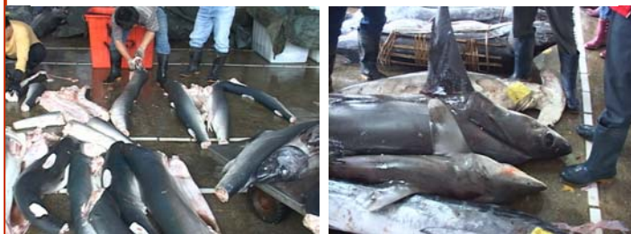
Shark Fishery in the Fishing Village of Suao, Taiwan