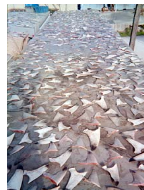
Shark Fins Drying on the